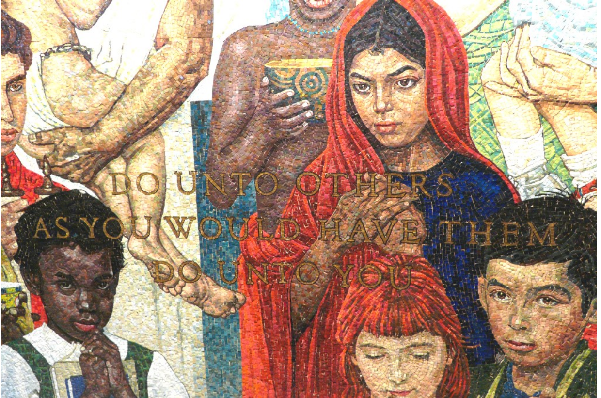
The Golden Rule, from Art in the Christian Tradition, a project of the Vanderbilt Divinity Library, Nashville, TN.

All Saints' Sunday Baptism + Holy Eucharist, Rite II November 3, 2019 • 10 am