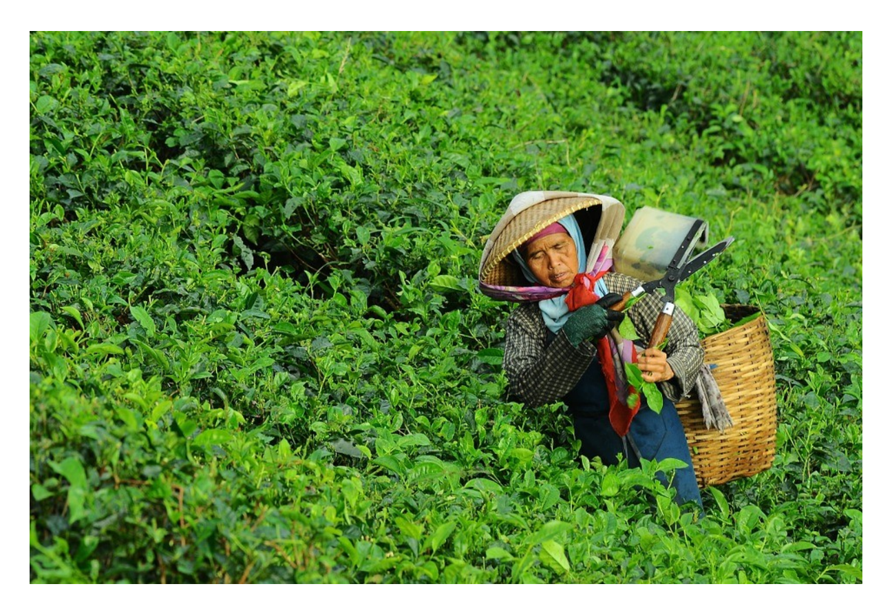
Woman Harvesting Tea