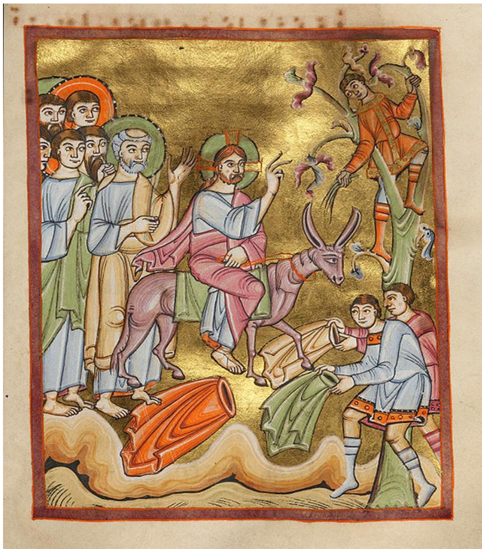
Entry into Jerusalem from Art in the Christian Tradition , a project of the Vanderbilt Divinity Library, Nashville, TN.